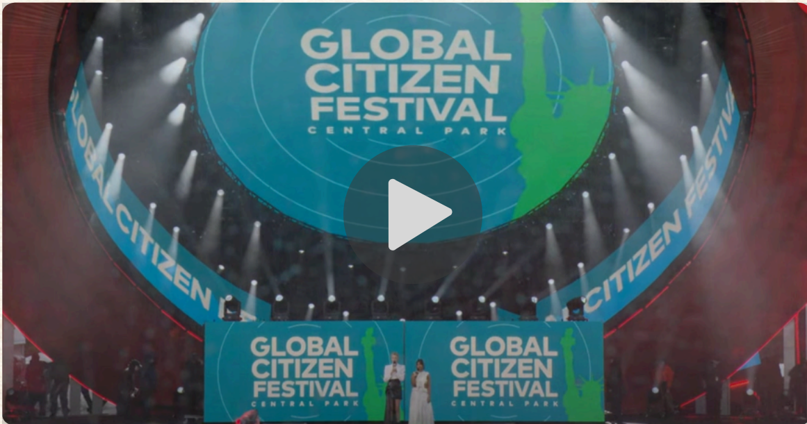
CHARLIZE THERON SPEAKING ABOUT SRHR & GENDER EQUITY AT THE 2023 GLOBAL CITIZEN FESTIVAL

Storytelling can inform, inspire, move, and connect people and resources. It is one of the most powerful ways to advocate for change. In 2023, CTAOP organized, hosted, authored, shared resources, and served as facilitators, panelists, interviewees, interviewers, and participants in over 40 activities related to allyship and advocacy in the spaces of youth health, GBV prevention, and trust-based philanthropy. Additionally, CTAOP hosted, co-hosted, or facilitated 15 in-person gatherings, workshops, and panels (10 with Program Partners). To support capacity strengthening, we connected Program Partners to funding and grant opportunities, fellowship and bursaries, and organizational and programmatic resources. In addition, CTAOP team members participated in 7 publications about trust-based philanthropy, 3 podcasts, and 14 speaking engagements.