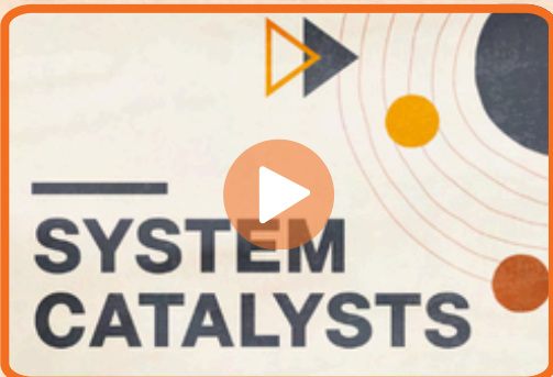
CTAOP and Program Partner, KZN Network on Violence against Women featured on the Systems Catalysts podcast