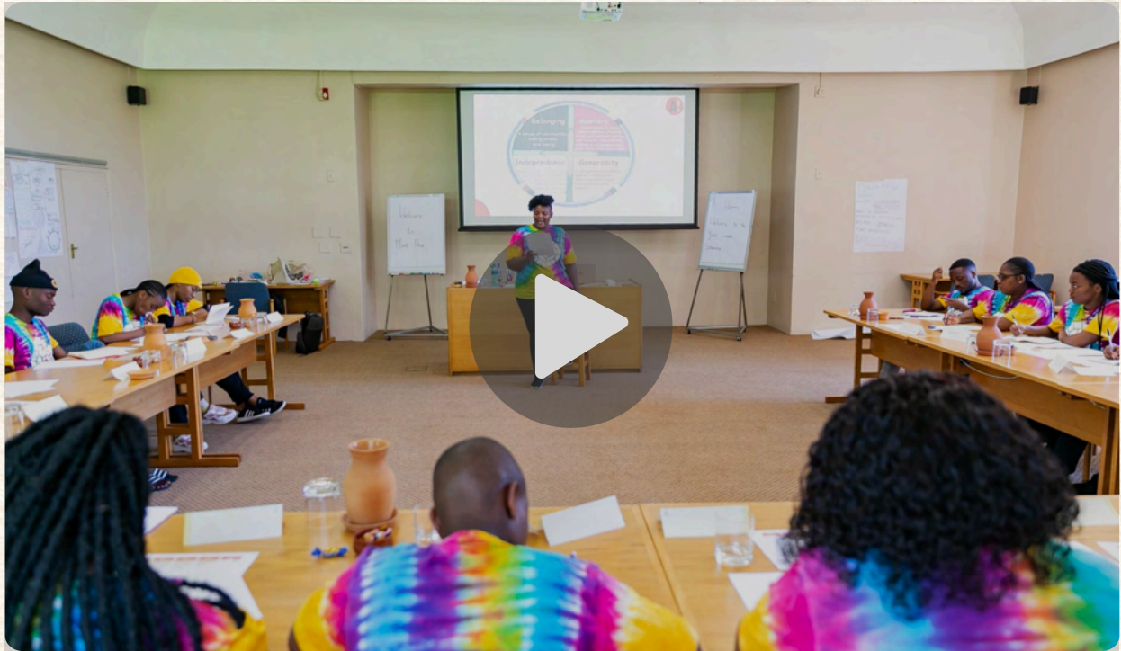
YOUTH LEADERS SCHOLARSHIP VIDEO (2023) FILMED AND PRODUCED BY ONEPASS PRODUCTIONS

CTAOP's Youth Leaders Scholarship (YLS) program aims to cultivate and strengthen community leaders in South Africa by providing comprehensive scholarships for tertiary education, including individually tailored academic counseling, psychosocial support, and leadership skills-building work.