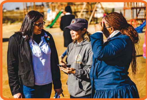
IPASA article published in South Africa titled " Journeying towards trust-based philanthropy " >