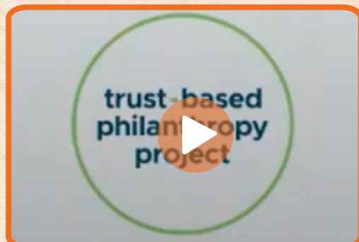
CTAOP participated in a panel called, " What Does Grantee Accountability Look Like in Trust-Based Philanthropy? " as part of a series on Demystifying Trust-Based Philanthropy