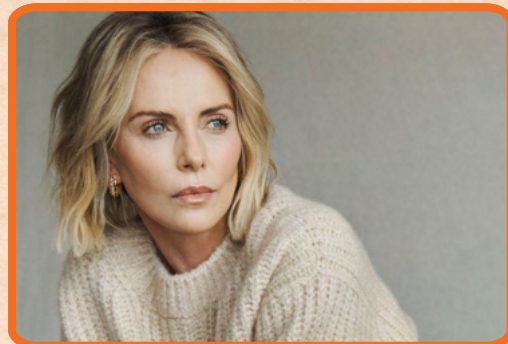
CTAOP's Founder spoke at the Town & Country Philanthropy Summit and was featured in Town & Country Magazine >