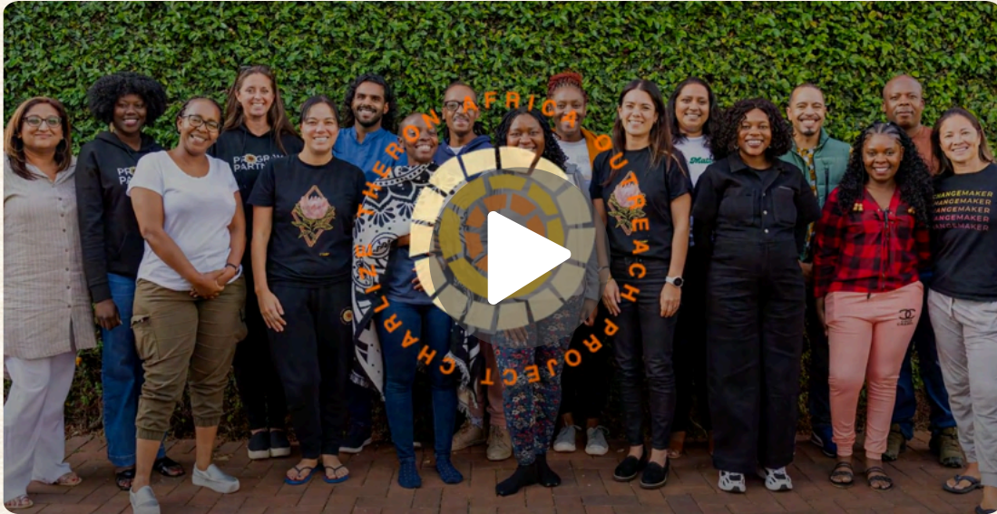
PROGRAM PARTNERS CONVENE IN JOHANNESBURG, SOUTH AFRICA FOR ONE OF THREE CTAOP REGIONAL SWIDLER SUMMITS IN 2023 SWIDLER SUMMIT VIDEO (2023) FILMED AND PRODUCED BY ONEPASS PRODUCTIONS